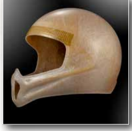
PB-cLc² Outer shell