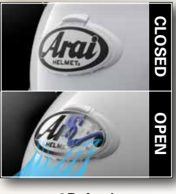
3D Arai logo duct